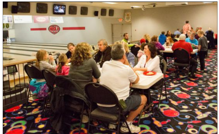
Rotarians and their families enjoyed an evening of pizza and bowling last Friday night..