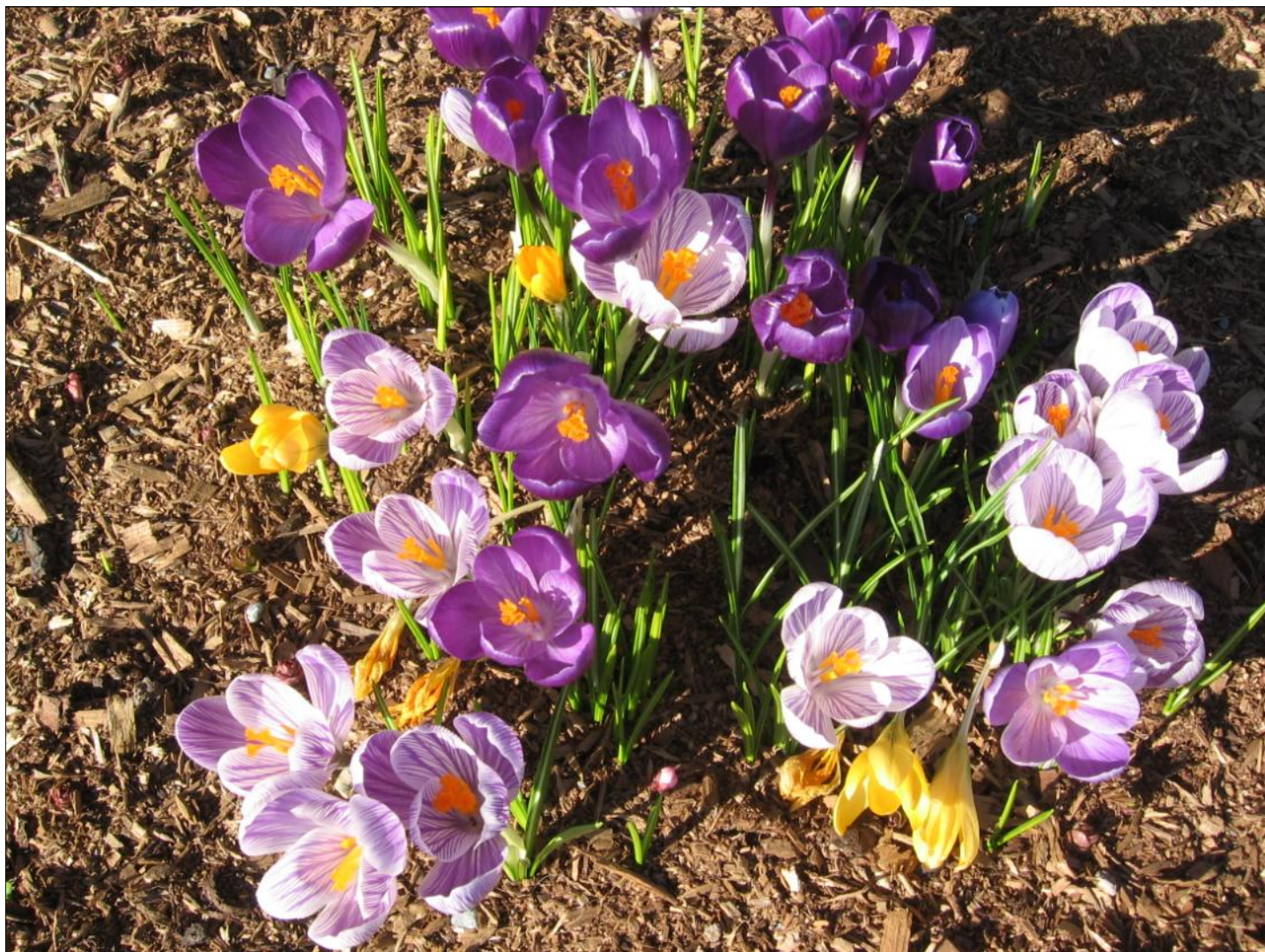
Spring scene—Crocuses pushing through the earth into the sunlight.

Club Meeting Friday at 12:00 p.m. at the Coast Bastion Inn